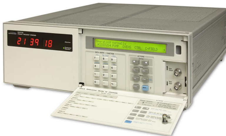
5071A Primary Frequency Standard

The 5071A offers exceptional stability and is the first cesium standard to specify its stability for averaging times longer than one day. The instrument takes into account environmental conditions that can heavily influence a cesium standard's long-term stability. Digital electronics continuously monitor and optimize the instrument's operating parameters.